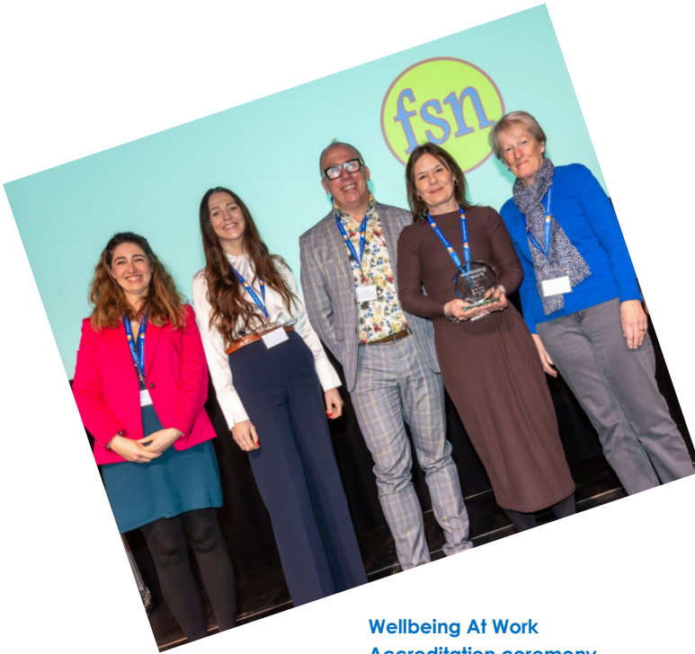
Wellbeing At Work Accreditation ceremony