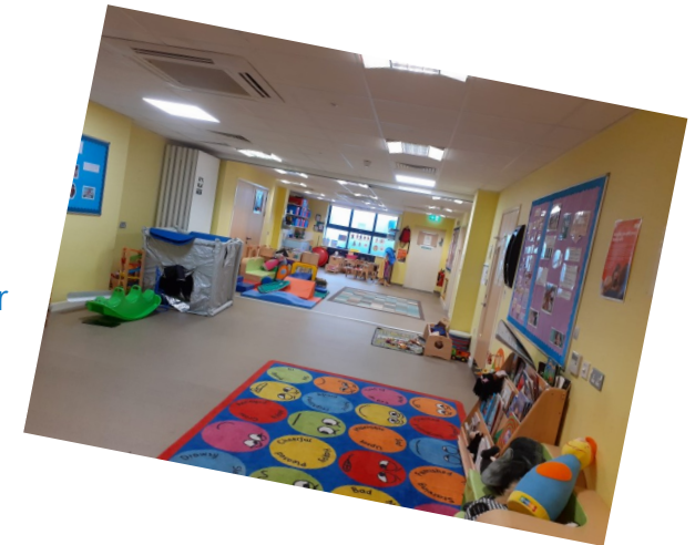
The Eastbourne TA Hub