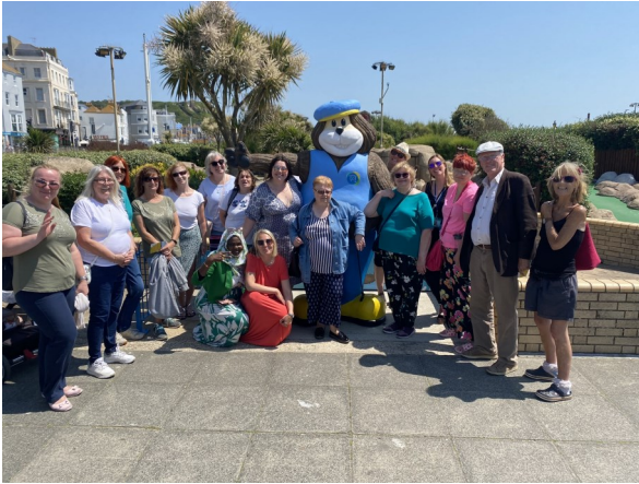
Celebrating Volunteers Week 2023