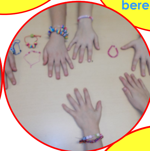
VOLCANO OF FEELINGS